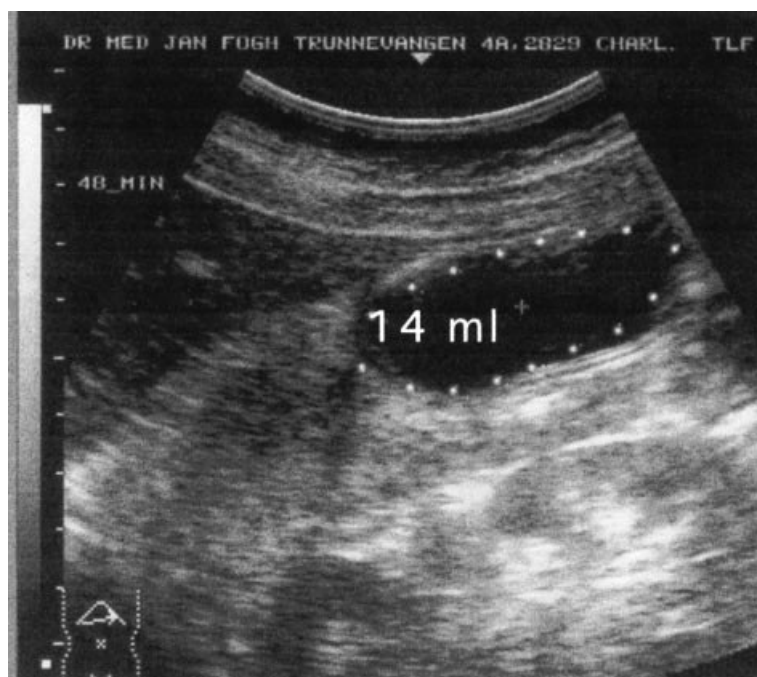
Figure 1 Ultrasound scan with computer-generated ellipsoid superimposed.

projection was an oblique upward view with the transducer positioned under the left curvature allowing the gastric fundus, body and antrum to be inspected, and the second was a transverse view across the epigastrium with a slight upward direction viewing the antrum, pylorus and the duodenal bulb. The two projections ensured very clear visual estimation of the volume (see Fig. 1). All examinations were recorded on videotape and still pictures were taken every 5 min.